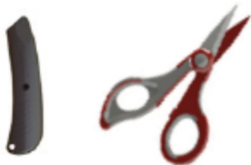
Knife or Scissors